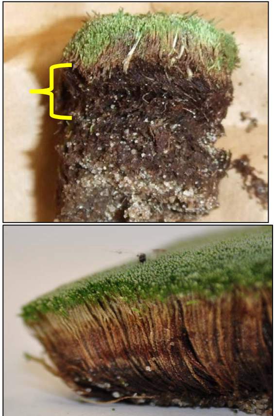
Figure 3 and 4. Moss rhizoids anchoring silverythread moss into a thatch layer, and close-up view of rhizoids and shoots.

surface. Additionally, mosses produce an extensive rhizoid system, allowing them to anchor to almost any stable substrate. Rhizoids resemble the roots of vascular plants (Figures 3-4), but typically lack the ability to absorb water and nutrients from the soil rootzone. Mosses can spread through asexual (vegetative) propagation. Both rhizoids and leafy, green tissue of mosses (thallus) develop from a slimy, black mat (protonema) that can be mistaken for algae, especially on golf course putting greens.