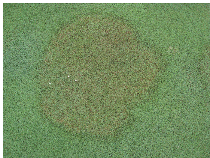
Figure 7. Brown patch symptoms in putting-green height creeping bentgrass. Patches are yellow to brown and sometimes exhibit a smoky-gray color at the edge.