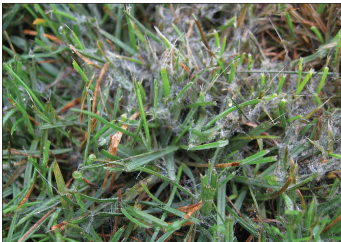
Figure 5. Cobweb-like fungal growth (mycelium) is sometimes visible on dewy mornings, primarily at the edges of patches.