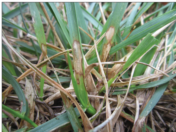
Figure 4. Brown patch lesions and blighted leaves.