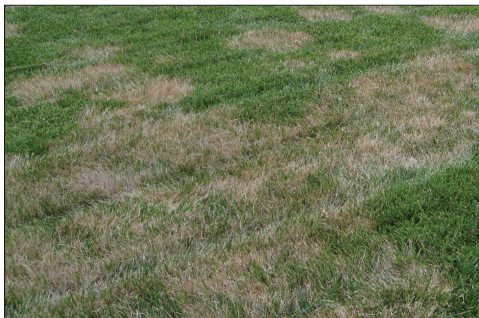
Figure 1. Discrete patches of brown patch in tall fescue.

Fairways: In golf course fairways, the symptoms are similar to lawn-height turf. The disease causes blighting (Figure 6), and the patches can develop smoke rings. When weather is very humid, fungal mycelium may be visible at the edge of the patch (figures 5 and 6). Foliar Pythium