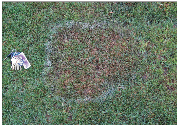
Figure 6. Brown patch symptoms in perennial ryegrass, with cobweb-like fungal growth (mycelium) at the margins.

blight also occurs in perennial ryegrass and creeping bentgrass fairways under the same weather conditions, and it can cause similar symptoms and mycelium. If in doubt, submit a sample for diagnosis, as most fungicides for brown patch are not effective for foliar Pythium and vice versa.