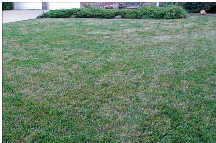
Figure 2. Diffuse symptoms in tall fescue.