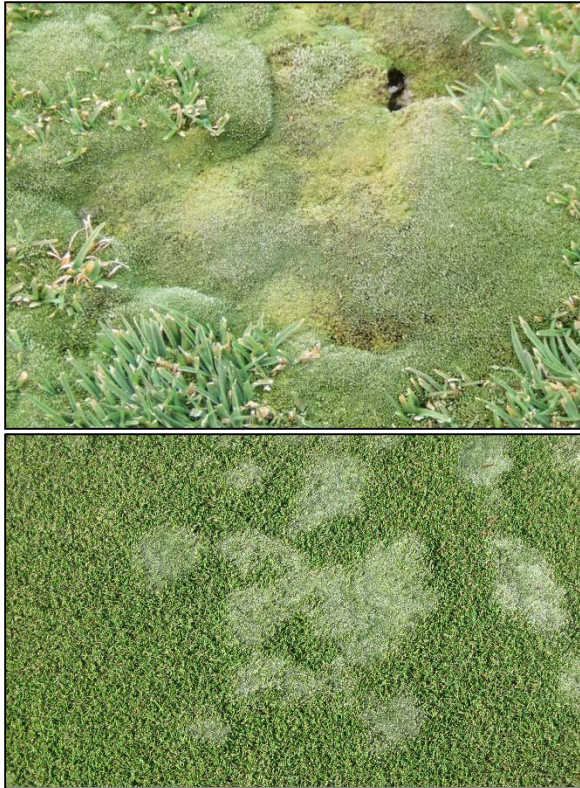
Figure 1 and 2: Silvery-thread moss in a creeping bentgrass putting green.

Mosses are difficult-to-control weeds in both taller-cut lawns and low-mow golf course putting greens. Several different species of moss can infest lawn-height stands of turfgrass, but silvery-thread moss ( Bryum argenteum Hedw.) is the most common species found in close-cut turf, such as golf course putting greens (Figures 1-2).